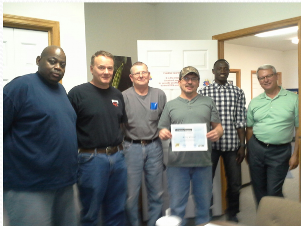
2 nd shift