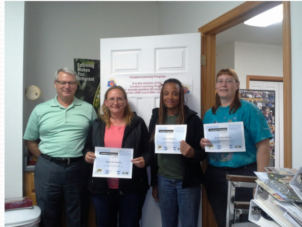
3 rd Shift