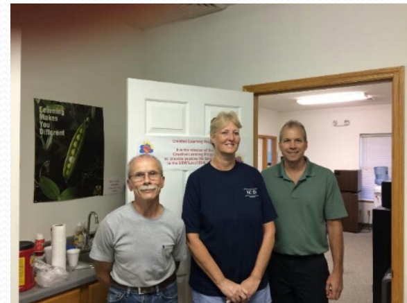
1 st shift