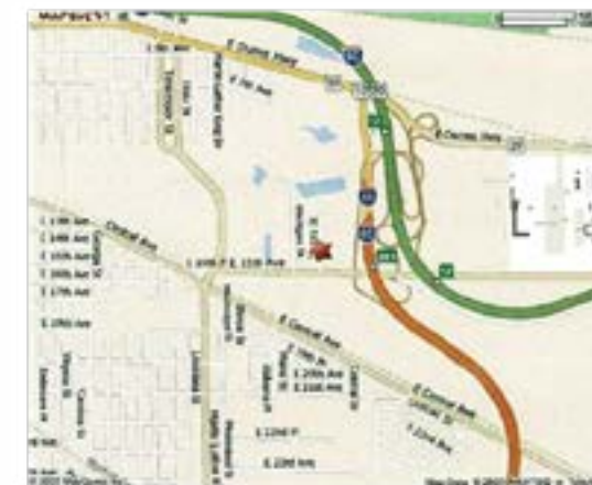
McBride Hall- Local Union 1014 1301 Texas Street, Gary, Indiana