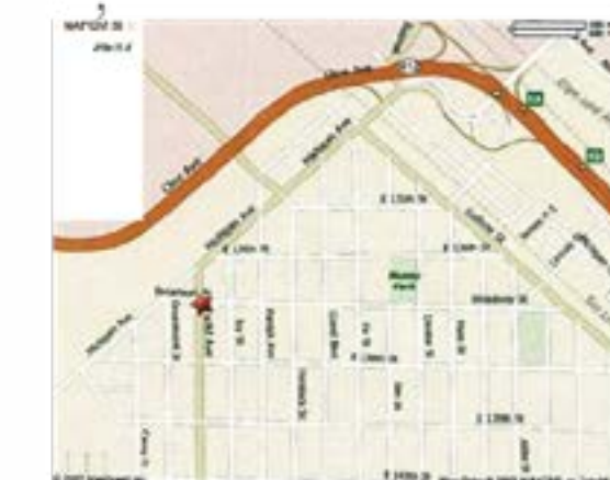
Leon Lynch Learning Center 1410 Broadway Ave., East Chicago, Indiana http://ihlearningcenter.org

Go to www.icdlearning.org . Find the catalog under resources.