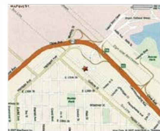
Bernard Kleiman Joblink Learning Center 3333 N Michigan, East Chicago, Indiana www.bkjoblink.org