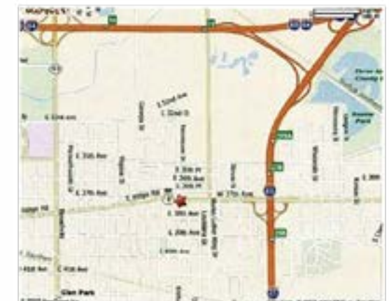
US Steel - Gary Works 1221 E. Ridge Road, Gary, Indiana www.usscareer.com