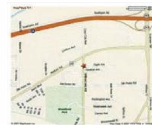
US Steel - Midwest Career Development 1919 Willowcreek Road, Portage, Indiana www.usscareer.com/midwest

To find out what classes are available check out the websites listed below.