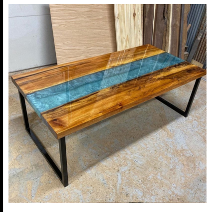
CLASS DATES: Tuesdays, April 19th, May 3rd, May 17th CLASS TIMES: 8:30am OR 4pm CLASS LOCATION: Edgar Thomson Union Hall