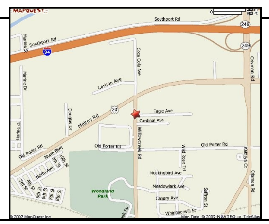
US Steel - Midwest Career Development 1919 Willowcreek Road Portage, Indiana