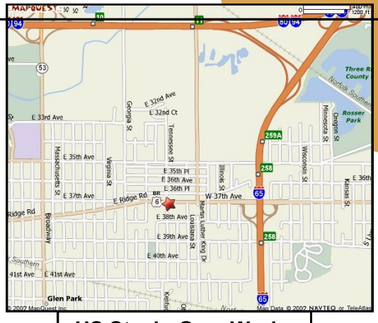
US Steel - Gary Works 1221 E. Ridge Road Gary, Indiana