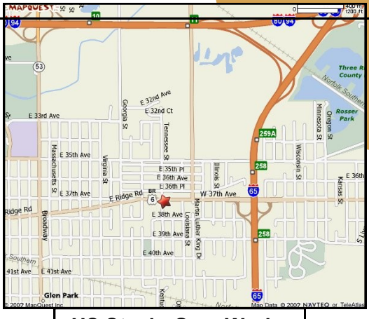
US Steel - Gary Works 1221 E. Ridge Road Gary, Indiana