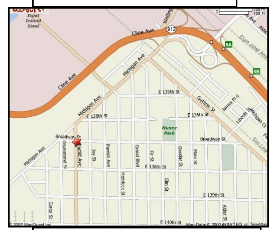
Leon Lynch Learning Center 1410 Broadway Ave East Chicago, Indiana