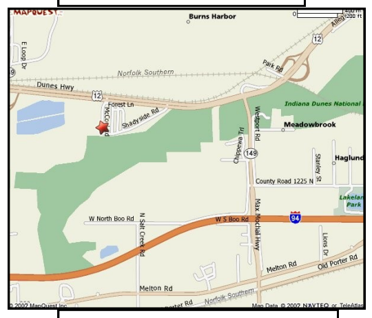
USW/Cleveland Cliffs- Burns Harbor 1275 1/2 McCool Road Burns Harbor, Indiana