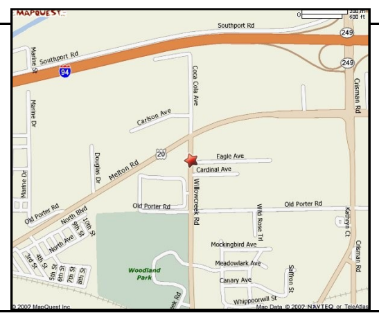
US Steel - Midwest Career Development 1919 Willowcreek Road Portage, Indiana