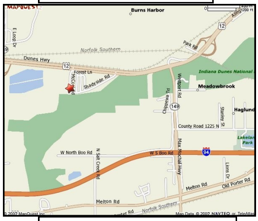
USW/MITTAL-Burns Harbor 1275 ½ McCool Road Burns Harbor, Indiana