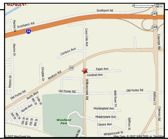
US Steel - Midwest Career Development 1919 Willowcreek Road Portage, Indiana