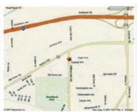
US Steel - Midwest Career Development 1919 Willowcreek Road, Portage, IN www.usscareer.com/midwest

To find out what classes are available check out the websites listed below.