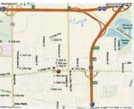
US Steel - Gary Works 1221 E. Ridge Road, Gary, IN www.usscareer.com