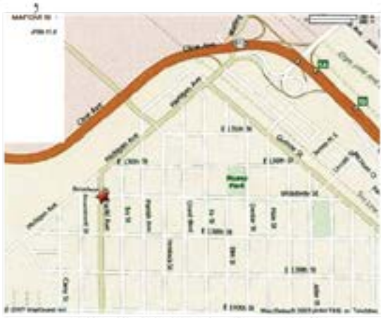
Leon Lynch Learning Center 1410 Broadway Ave., East Chicago, IN www.ihlearningcenter.org

\label{lem:condition} \textbf{Go to www.icdlearning.org. Find the catalog under resources.}