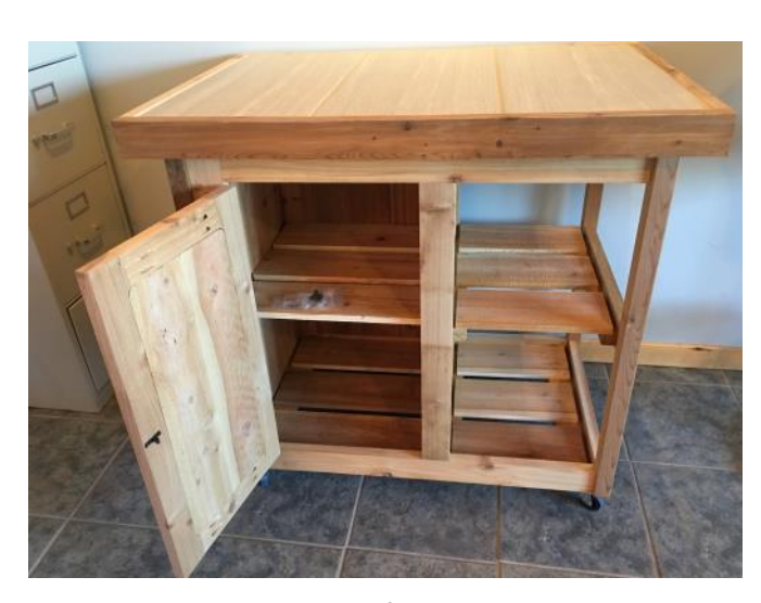
BBQ Cart from 2018 class.