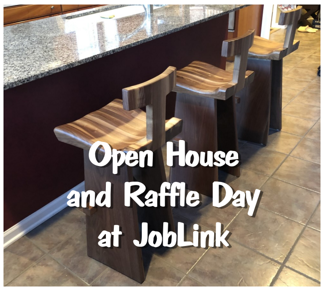
Table is not shown in this photo. The stools will be custom stained so that the winner gets just the right look!